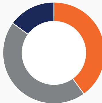
● Equities ● Bonds ● Cash

One of the benefits of choosing a portfolio is that you have built-in diversification within your investments, which can potentially assist in long-term growth objectives.